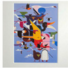
#105 bid $25 (0)