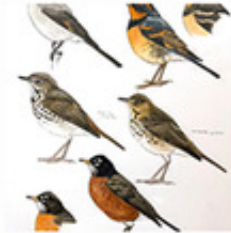
#101 bid $150 (1)

PRINTS AND ORIGINAL ARTWORK ( SEE LOT ITEM DESCRIPTIONS )