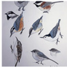
#103 bid $175 (3)