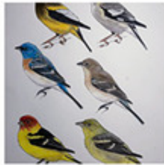
#102 bid $150 (1)