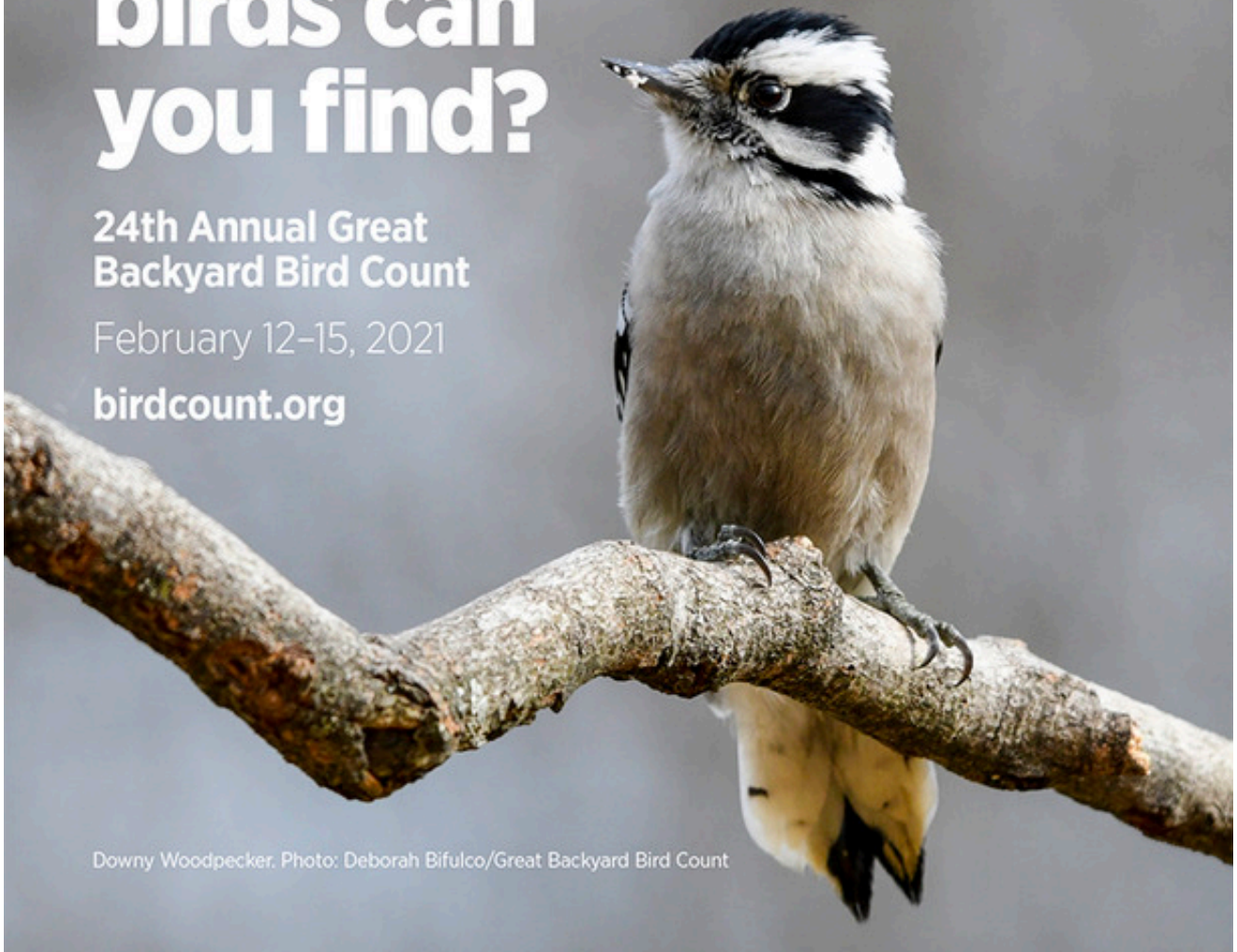
Downy Woodpecker.

Join birders across the world for this four day long survey of our neighborhood birds, February 12-15 . If you're searching for some citizen science to get involved with, looking for a motivation to keep listing your sightings, or just want to explore your local wildlife, this is a great count to take part in!