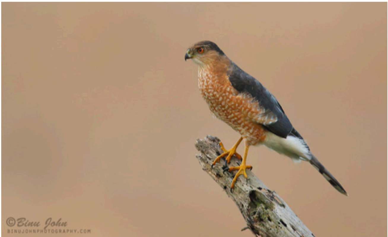
Cooper's Hawk.

You've spotted all sorts of birds in your yards and neighborhoods lately! In this month's All Around Town , read stories and see photos of backyard birds from our members and neighbors , including some of your favorites from 2020.