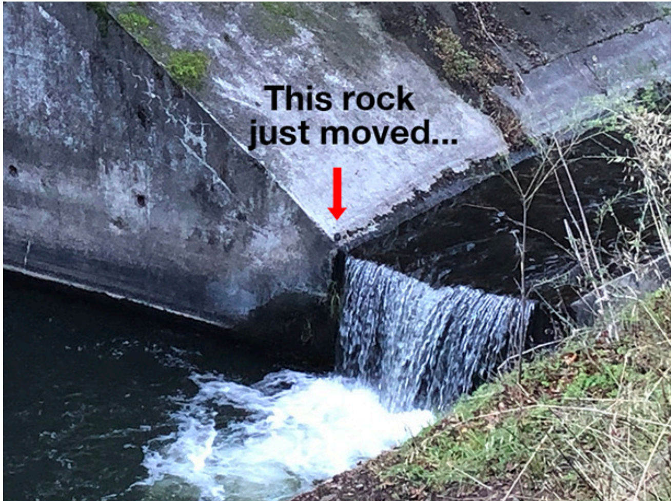
American Dipper along Los Gatos Creek, south of Main Street.