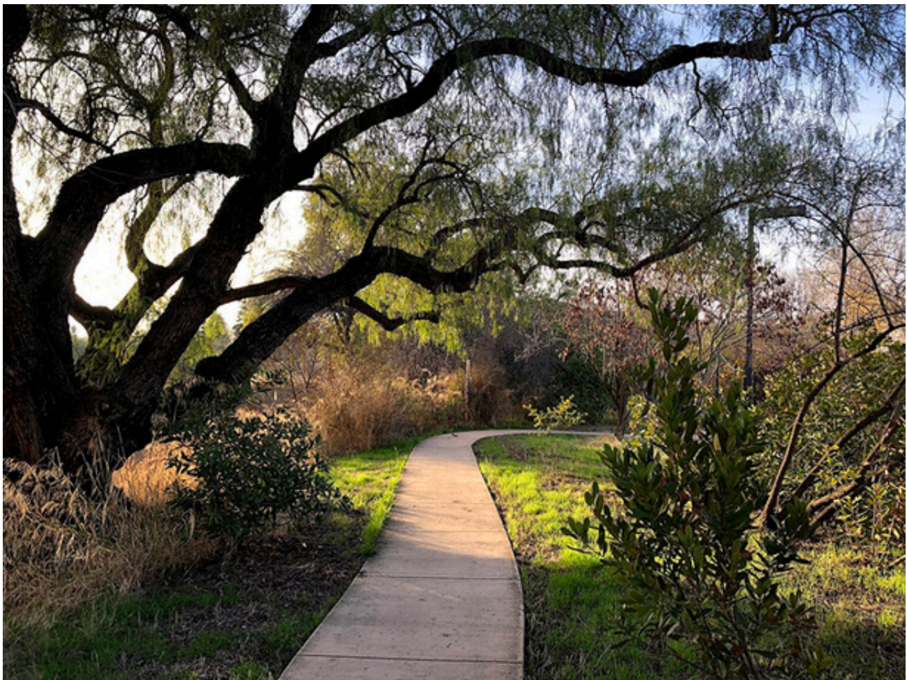
Santa Clara Valley Water District.

Spring is just around the corner and love is already in the air or in the water! Check out mating behaviors of raptors in Coyote Valley or paired up ducks at an urban pond or at the bay. Head to Picchetti Ranch for the oaks or visit Santa Clara Valley Water District Headquarters for some quiet trails. Children in your life having too much Zoom time? Try our new youth-centered trip.