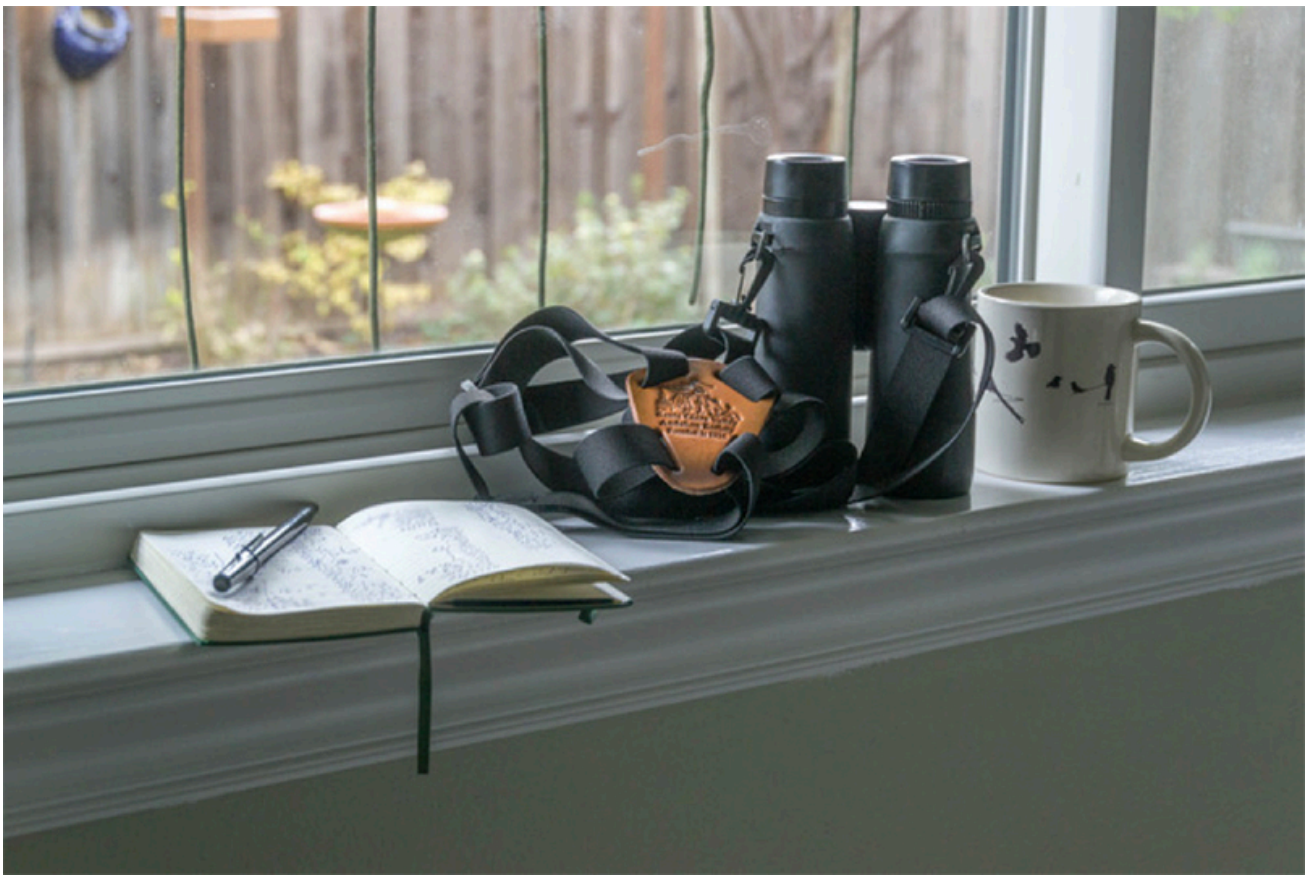
Bird count gear.

It's a new year - challenge yourself to do a regular bird count at home or another favorite spot! In The Habit of Counting Birds , learn how - and why - to record and share the birds you see.