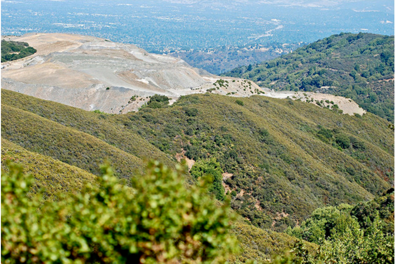
Permanente Ridge.