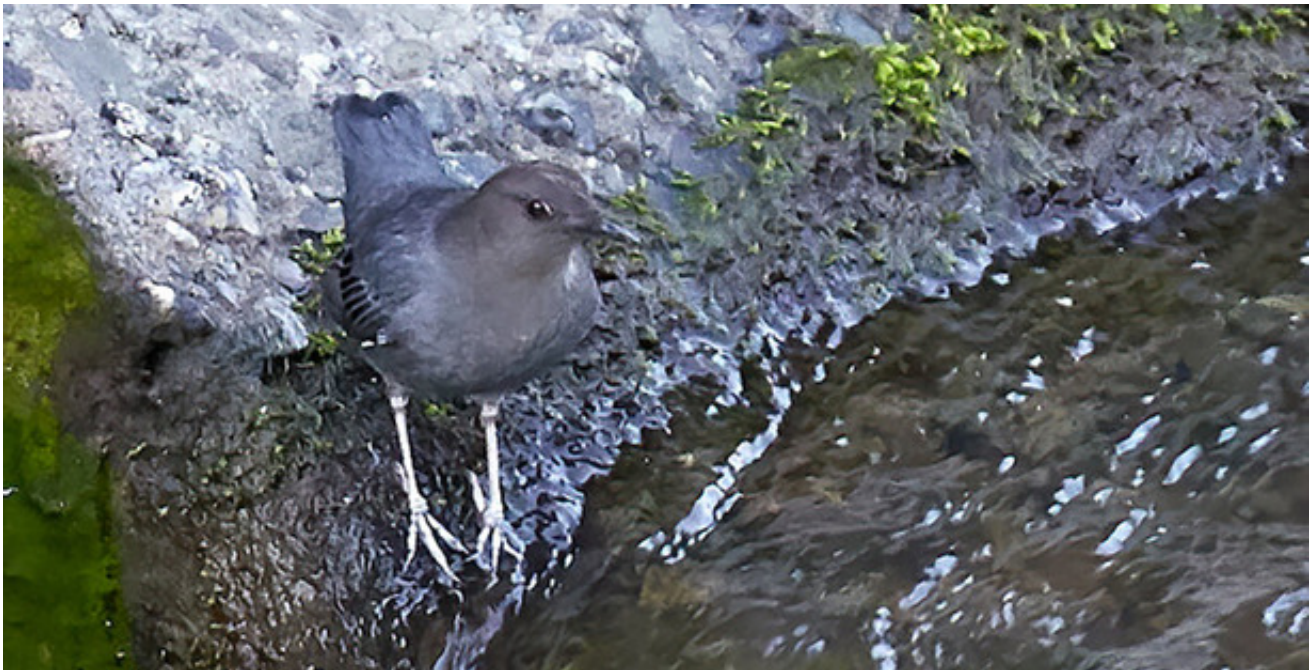
American Dipper