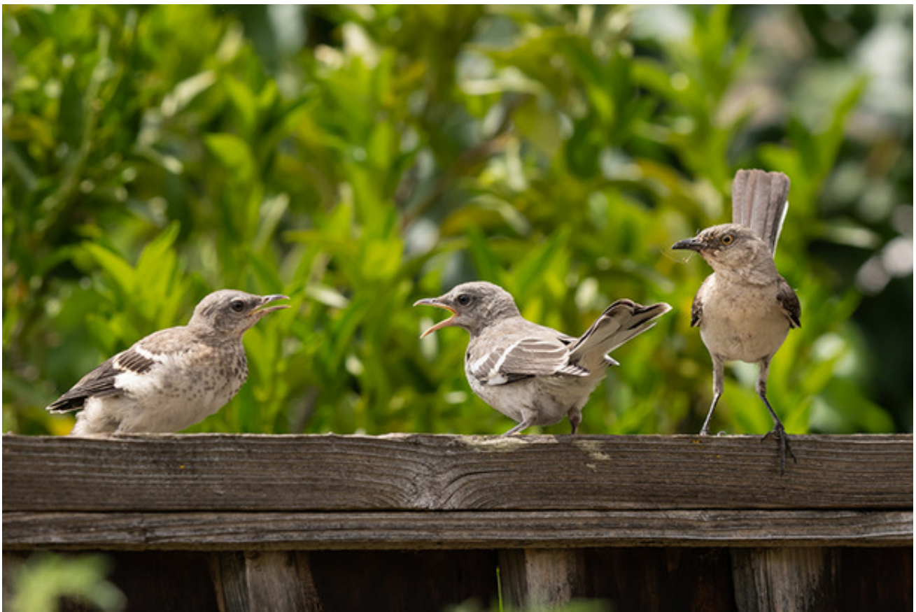
Northern Mockingbirds

Devoted parents, sparring rivals, and lots of splashing in the bath - summer's here! Watch summer bird behavior , and get tips for providing water to birds , in Love, War, and Water , our Backyard Birder's newest piece.