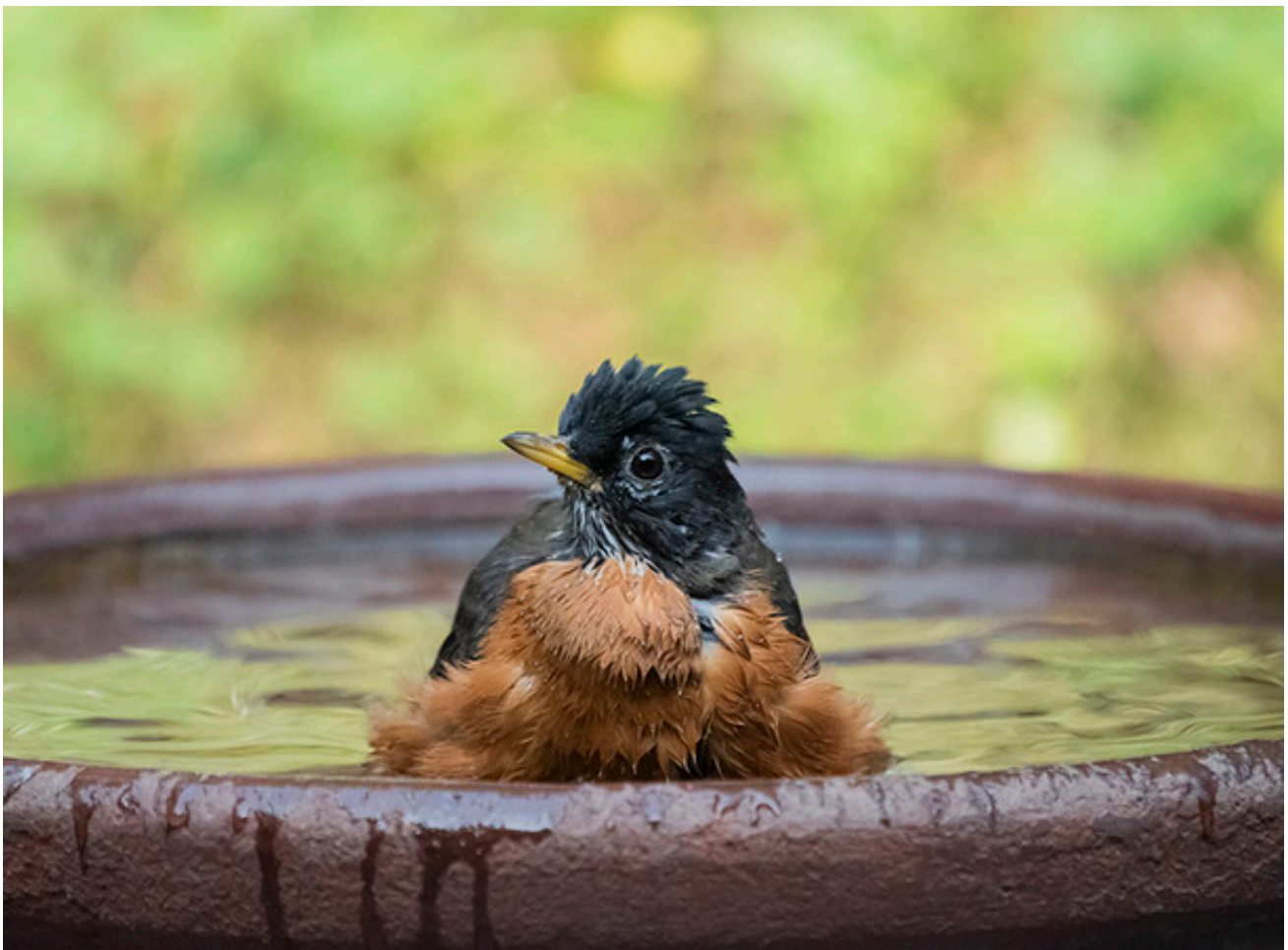
American Robin by Hita Bambhania-Modha

Summer's here and it's hot! High temperatures are difficult for birds, just as they are for us.