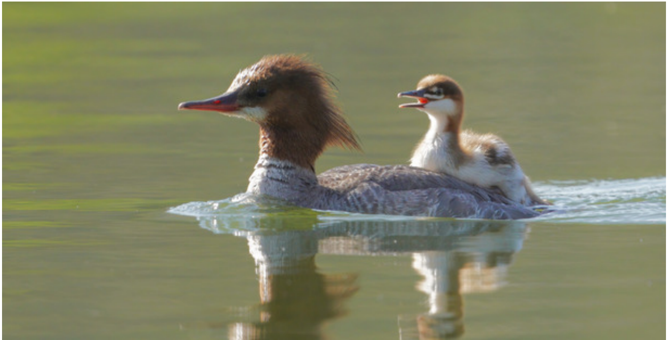
Common Mergansers.