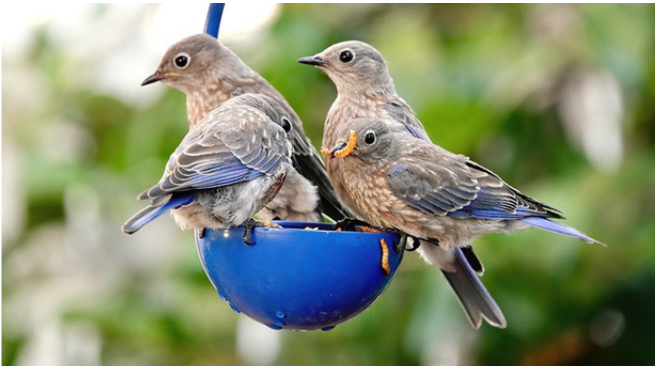
Western Bluebird juveniles: Carter Gasiorowski