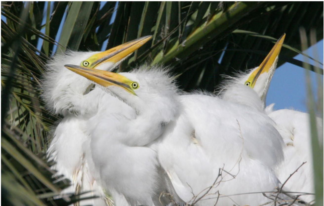
Great Egrets