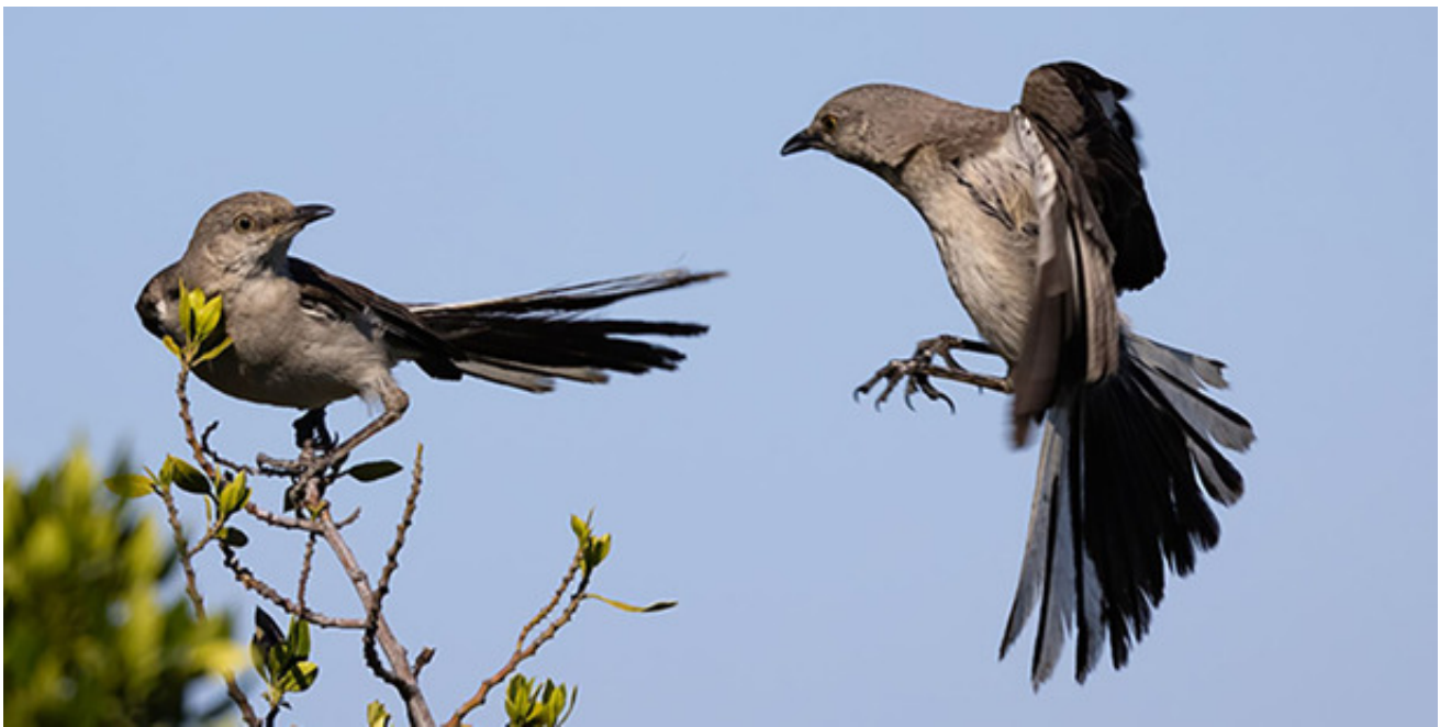
Northern Mockingbird.