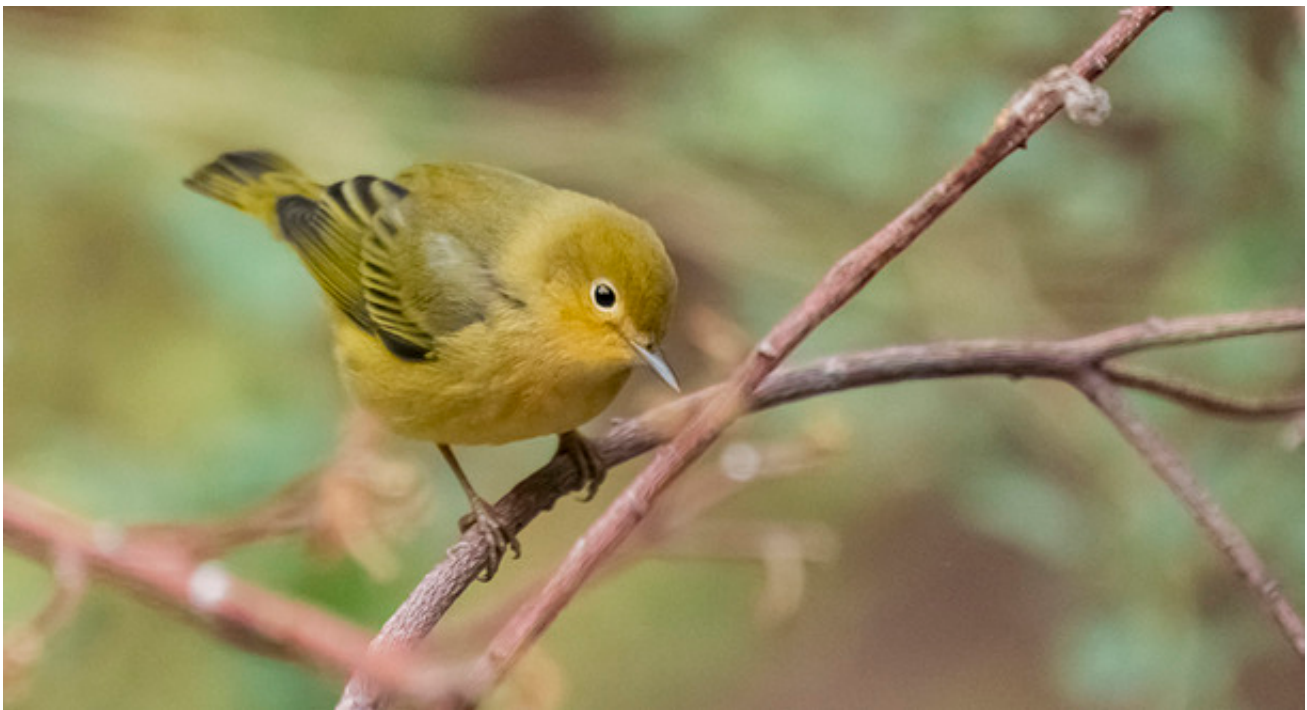
Yellow Warbler.