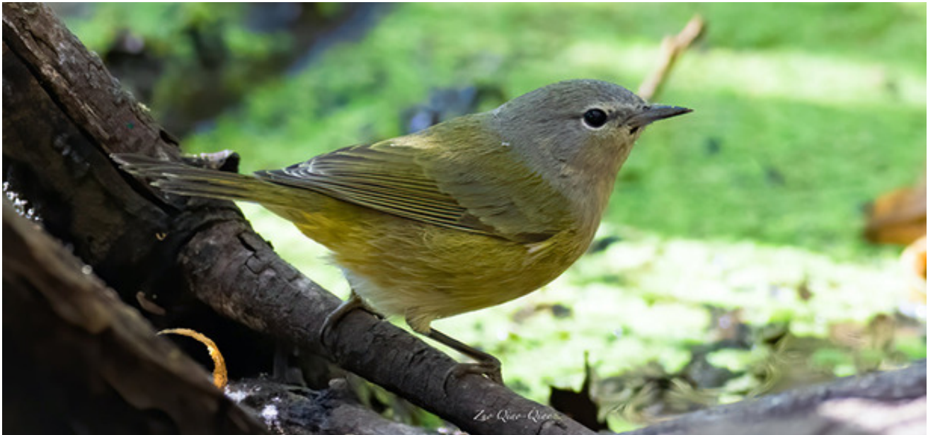
"Gray-headed" Orange-crowned Warbler.