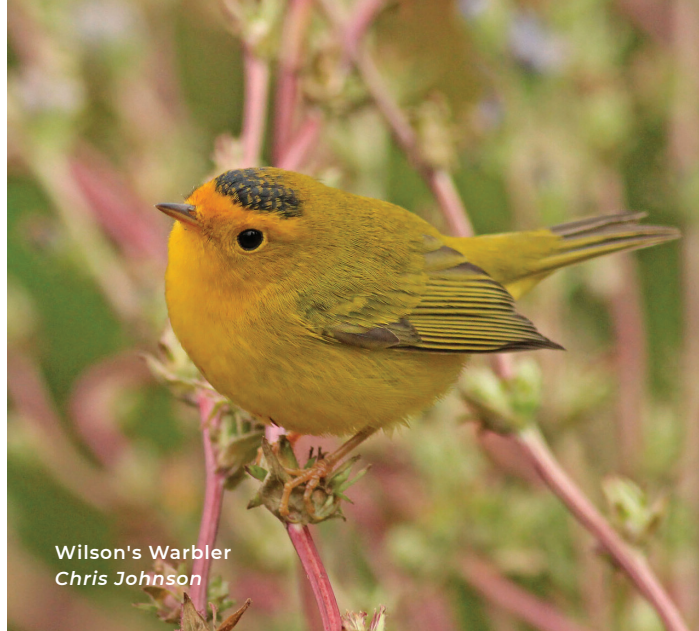
Wilson's Warbler