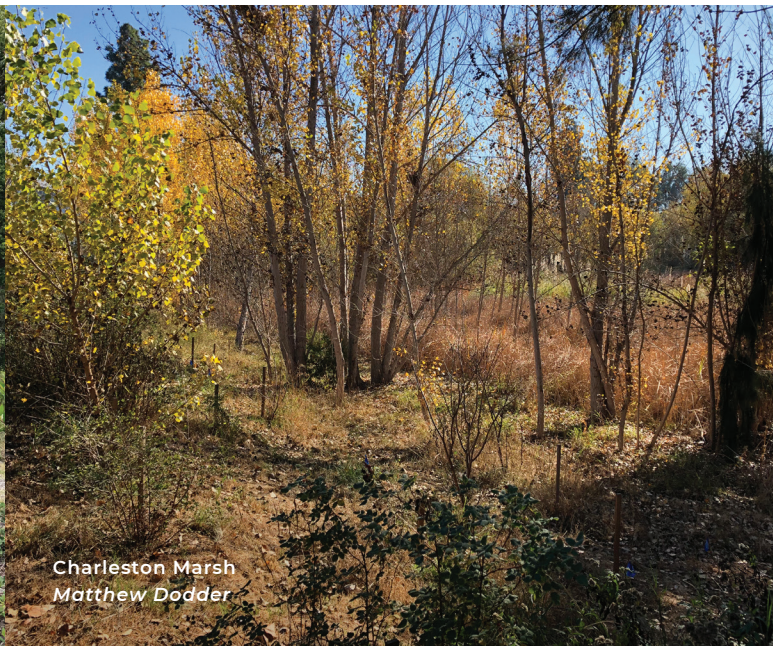
Charleston Marsh

recognized the benefits that nature (and birds) bring to the city, and that an approach that breaks silos is needed.