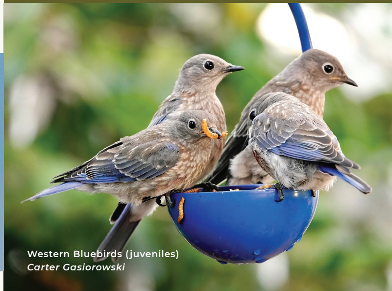
Western Bluebirds (juveniles) Carter Gasiorowski