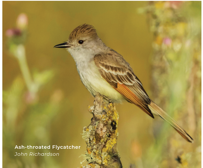
Ash-throated Flycatcher John Richardson

gray, greenish-brown, wing-barred birds of the forest interior. Pacific-slope Flycatcher is our most common example and it is relatively simple to identify. One finds it most often along riparian corridors, but backyard gardens and park edges will do as well. If you live in a location that resembles such areas, you might find their nondescript cup nest above your porch light, or in a tree out back. Its distinctive whistled call, which sounds like someone hailing a taxi, “hurry UP!!” is common and immediately recognizable. The disjointed song is heard less often but well worth learning.