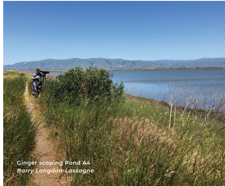
Ginger scoping Pond A4 Barry Langdon-Lassagne

Find all the details at scvas.org/birdathon