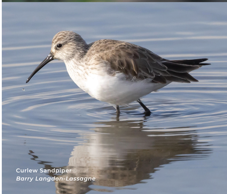
Curlew Sandpiper Barry Langdon-Lassagne