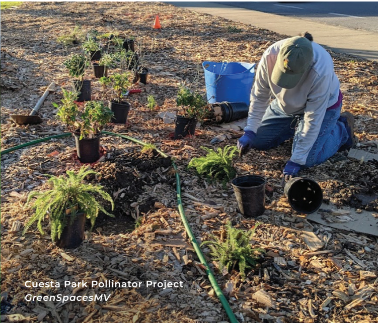
Cuesta Park Pollinator Project GreenSpacesMV