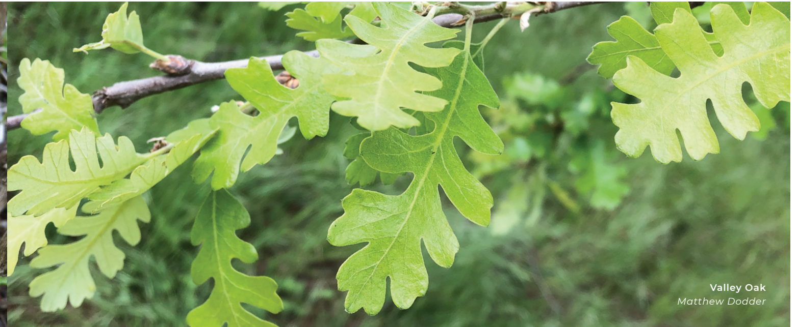
Valley Oak