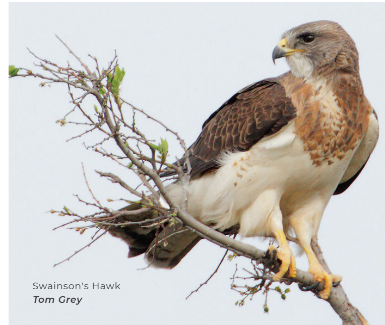
Swainson's Hawk Tom Grey

Photos L to R: Caspian Tern, Pacific-slope Flycatcher, Cliff Swallow, Warbling Vireo, Barn Swallow Tom Grey