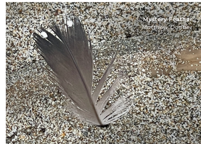
Mystery Feather