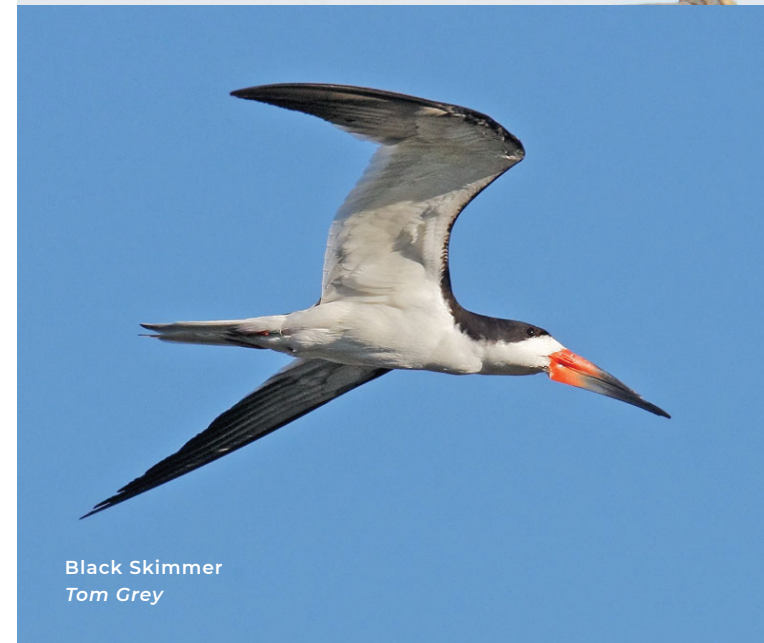
Black Skimmer Tom Grey