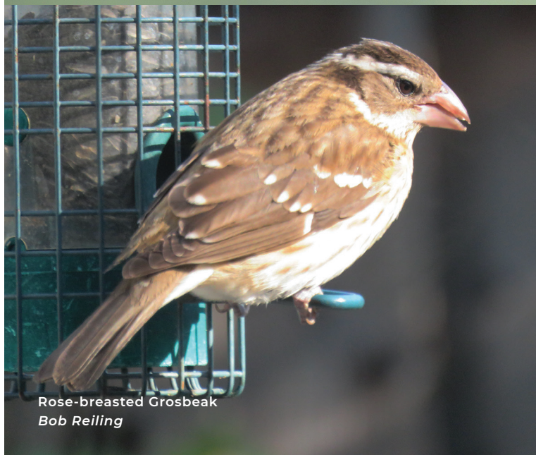
Rose-breasted Grosbeak