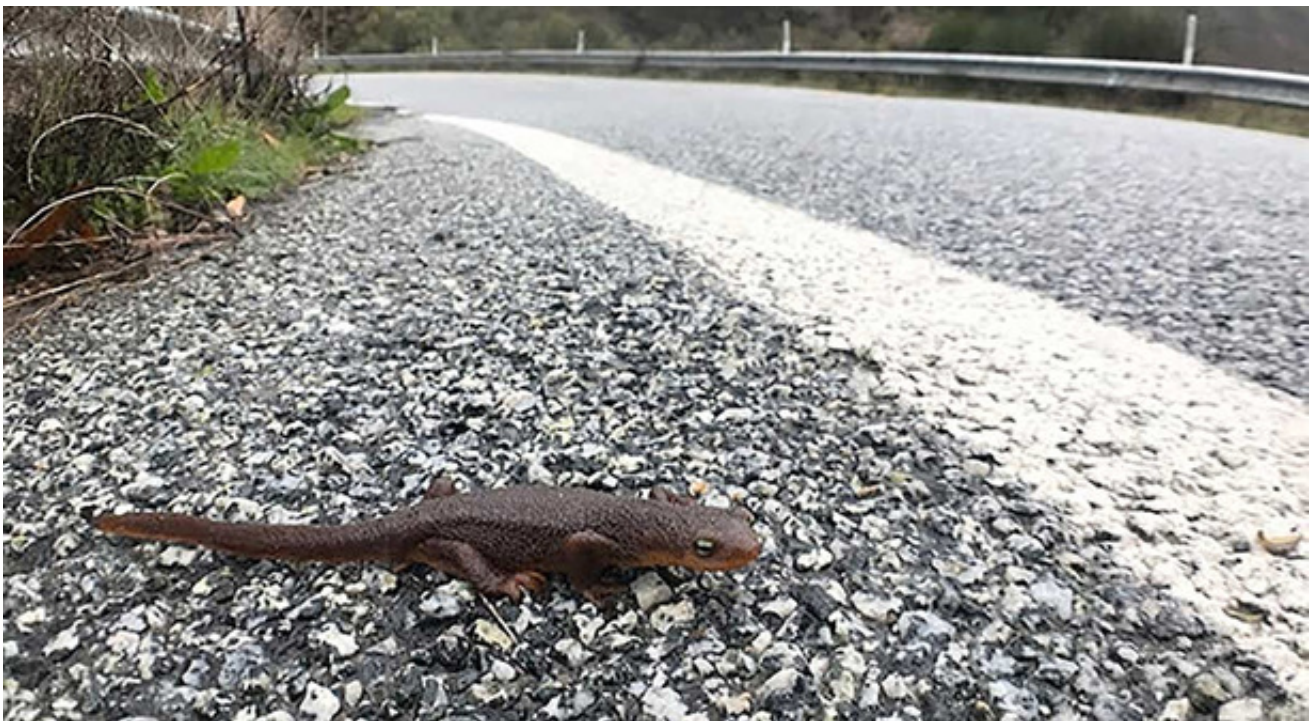
California Newt