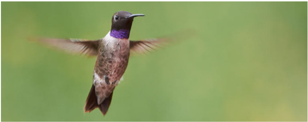
Black-chinned Hummingbird: Brooke Miller