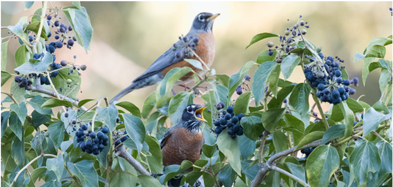
American Robin