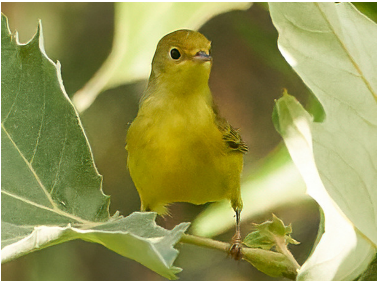
Yellow Warbler: Brooke Miller