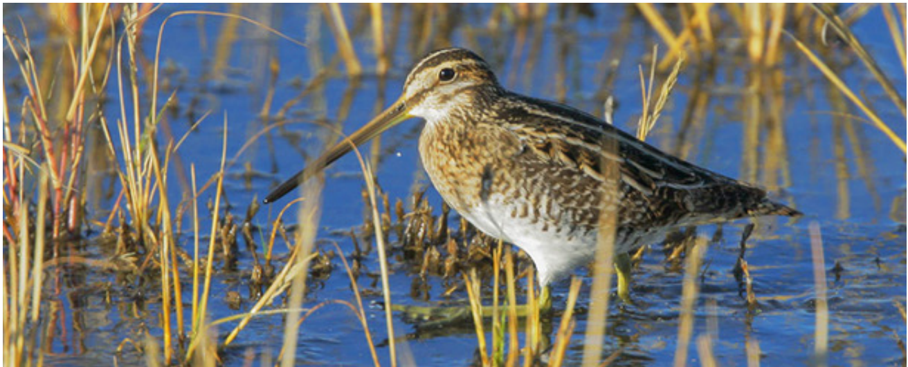
Wilson's Snipe: Tom Grey