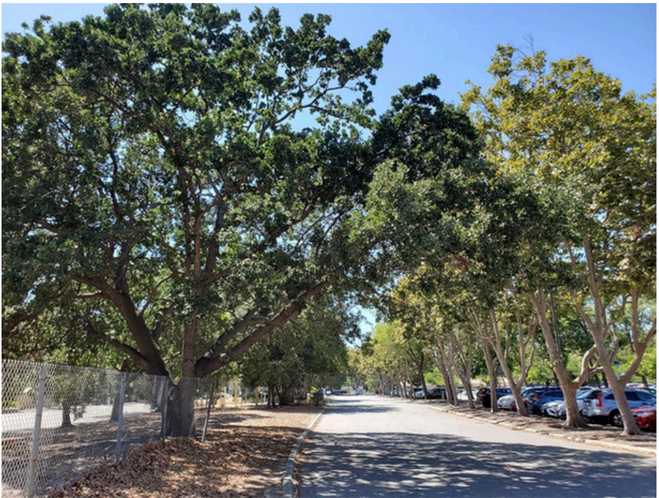
Above: These trees slated to be removed to make room for a sidewalk!