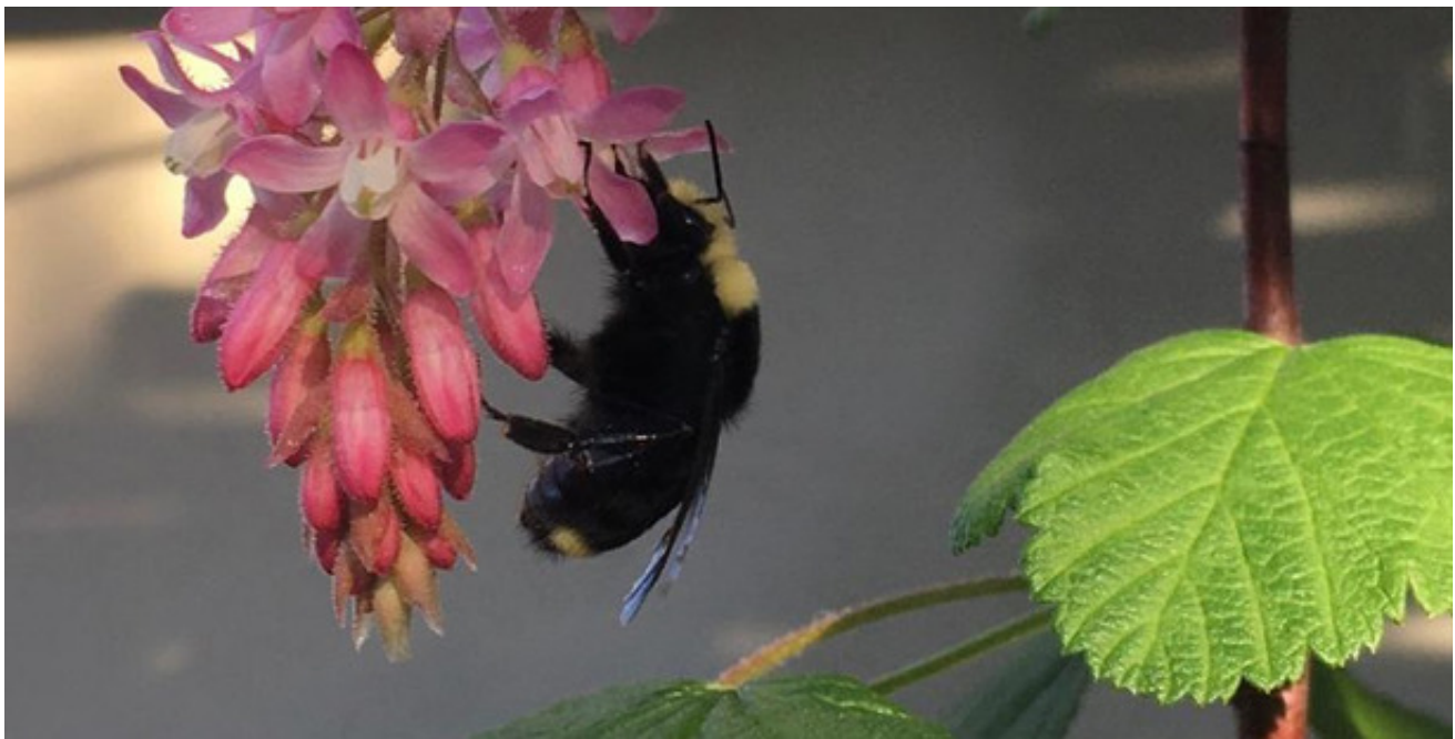
Red Flowering Currant ( Ribes sanguineum ) and Yellow-faced Bumblebee: Ann Hepenstal