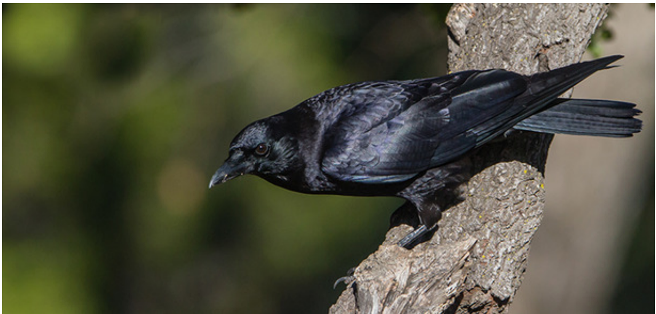
American Crow: Vivek Khanzodé