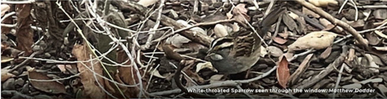
White-throated Sparrow seen through the window. Matthew Dodder

PRESENTATION MATTHEW DODDER AUTUMN BIRDING Mon, Sept 12, at 7:00 via Zoom