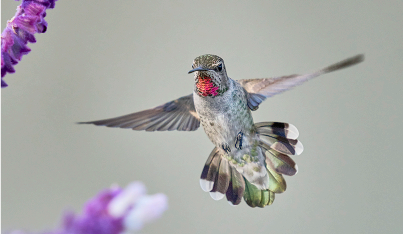
Anna's Hummingbird

The next All Around Town will be our special year-in-review! We invite you to share your favorite backyard and neighborhood birding stories of 2023.