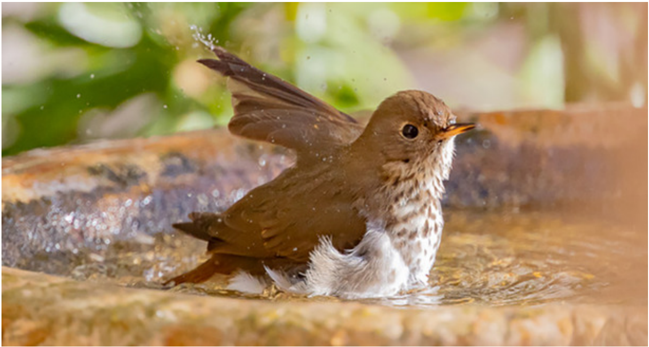
Hermit Thrush