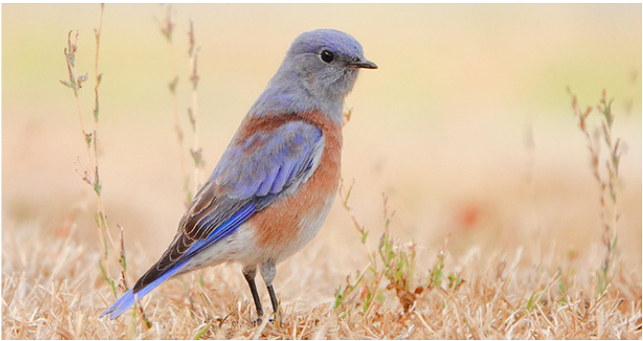
Western Bluebird: Carter Gasiorowski