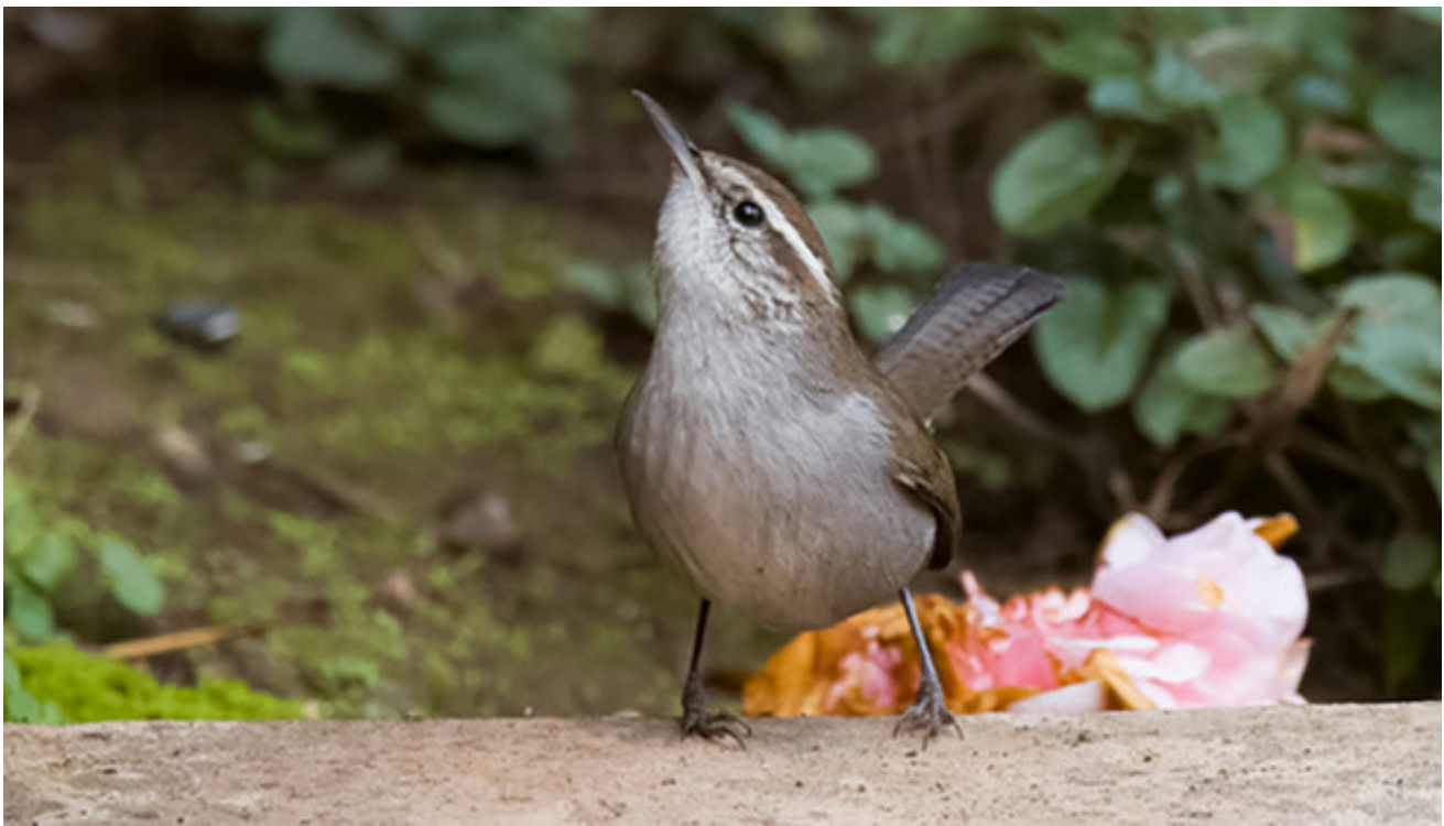
Bewick's Wren: Deanne Tucker