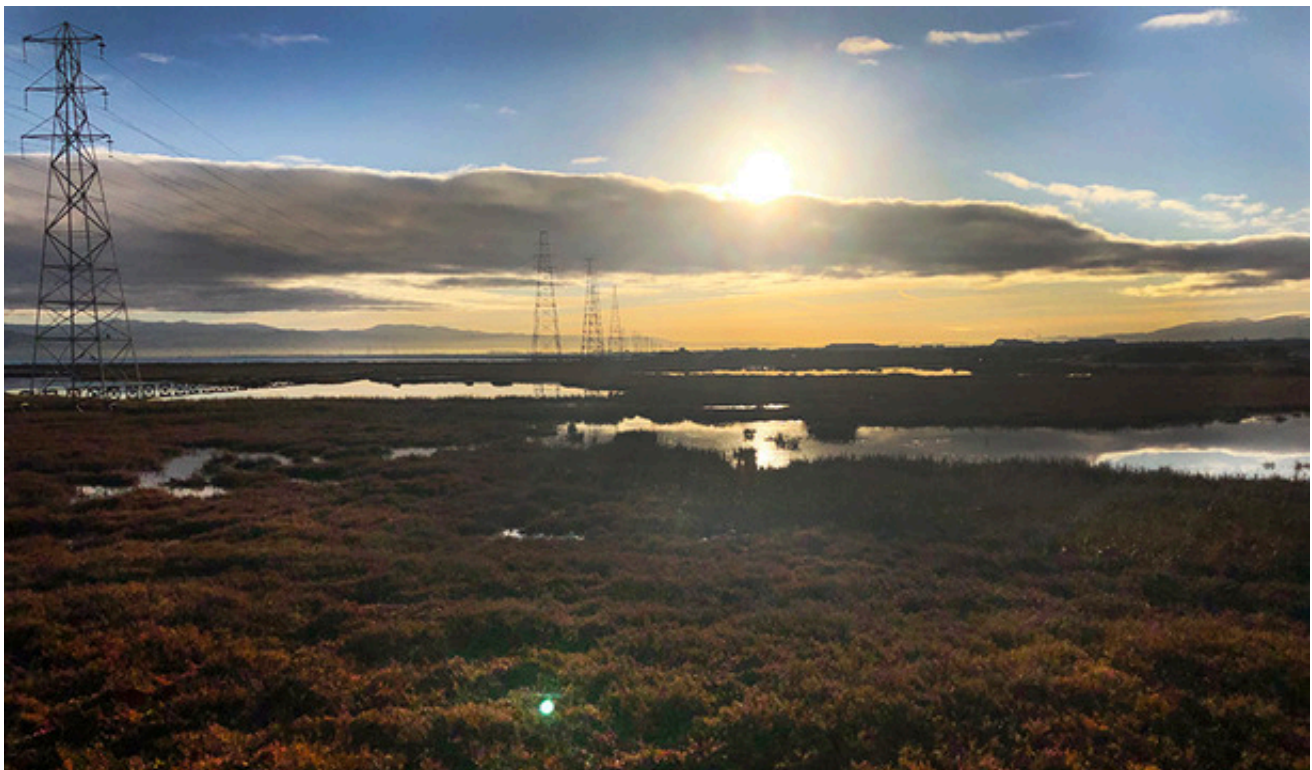
Palo Alto Baylands tidal marsh just beside the trail, the fragile home of Ridgway's Rail.

It's time to brush up on those pesky greenish-grayish mysteries that baffle so many of us. Learn the field marks, behaviors, habitat preferences and vocalizations for these insectivores during this two-session online class. Just in time for the Spring Birdathon when they start to arrive! Register here .