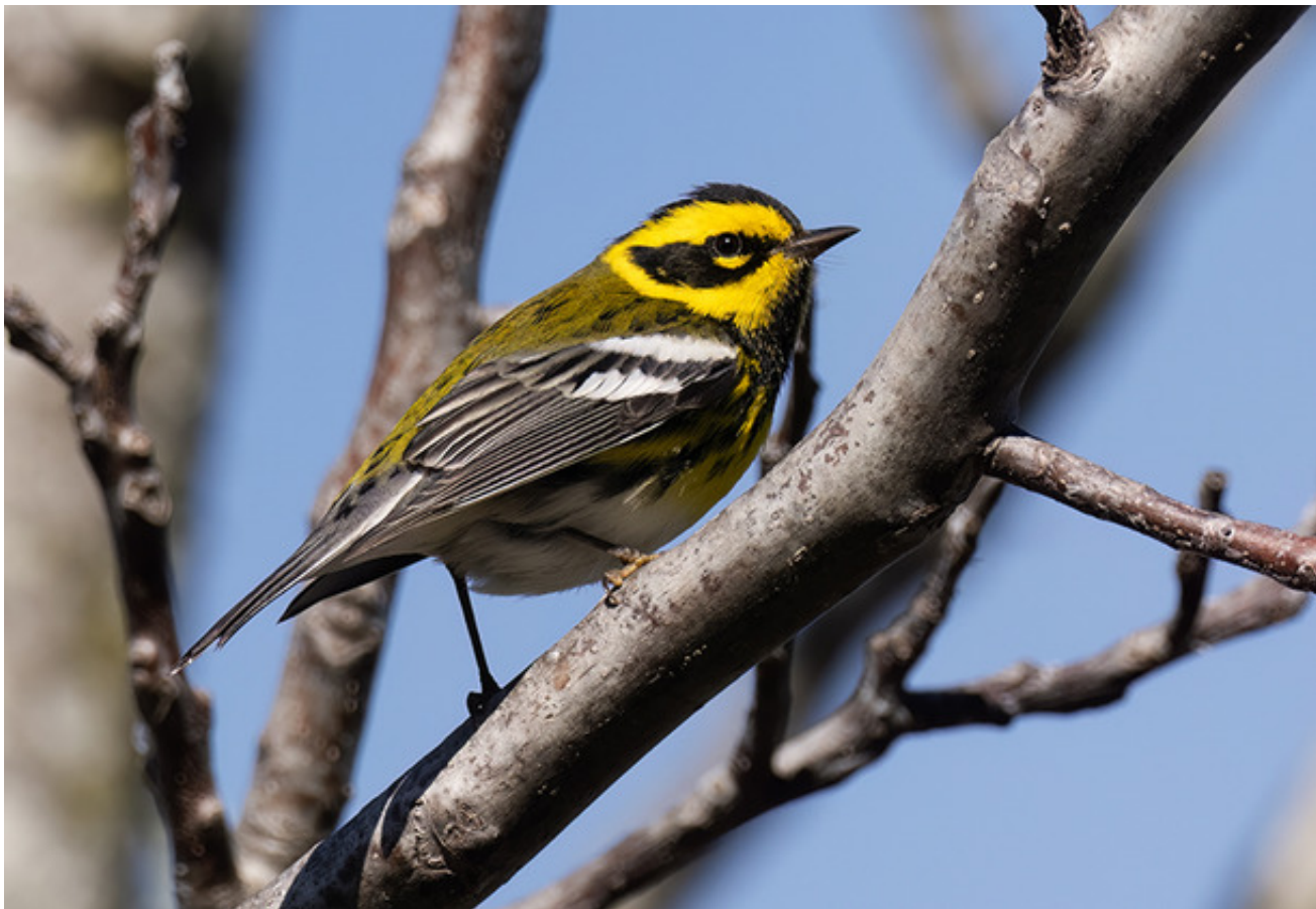
Townsend's Warbler: Deanne Tucker