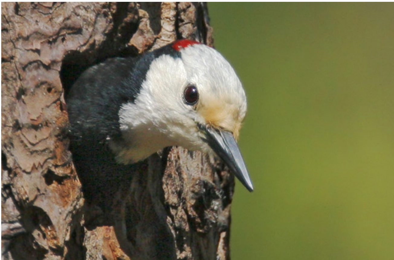
White-headed Woodpecker: Tom Grey