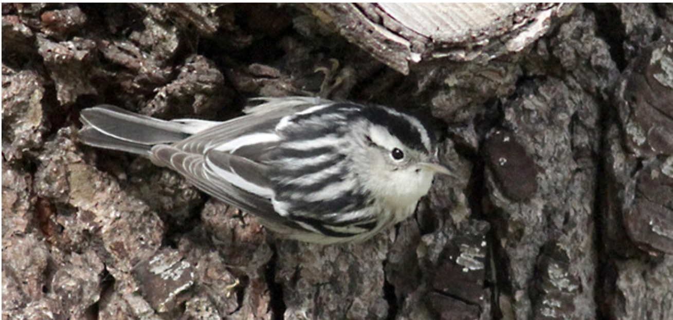
Black-and-white Warbler: Matthew Dodder