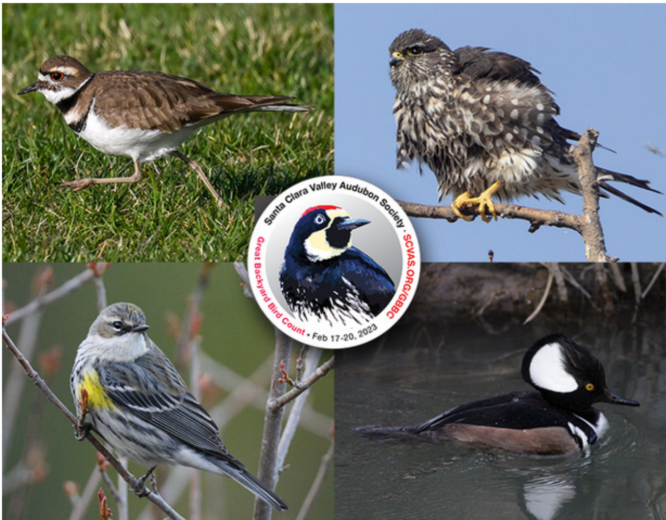
Killdeer, Merlin, Yellow-rumped Warbler, Hooded Merganser