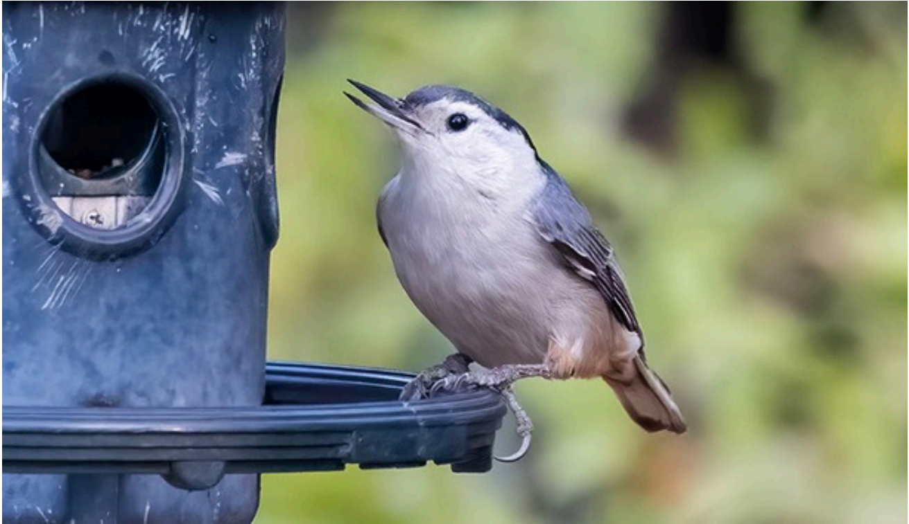
White-breasted Nuthatch: Deanne Tucker