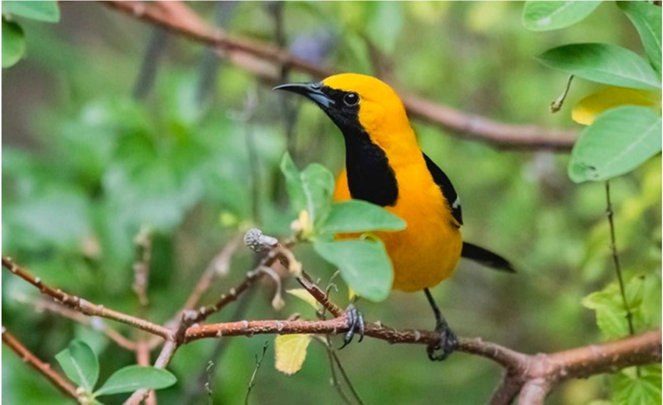
Hooded Oriole (male) by Hita Bambhania-Modha