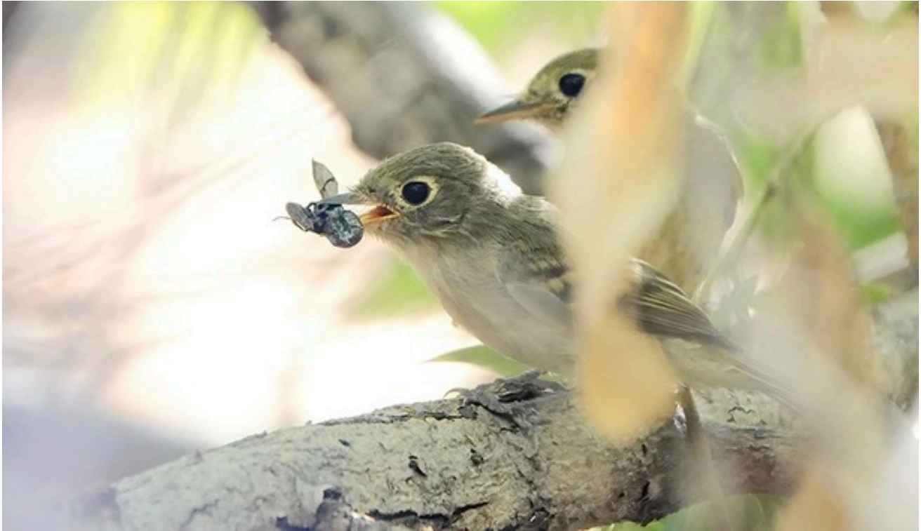
Pacific-slope Flycatcher: Carter Gasiorowski