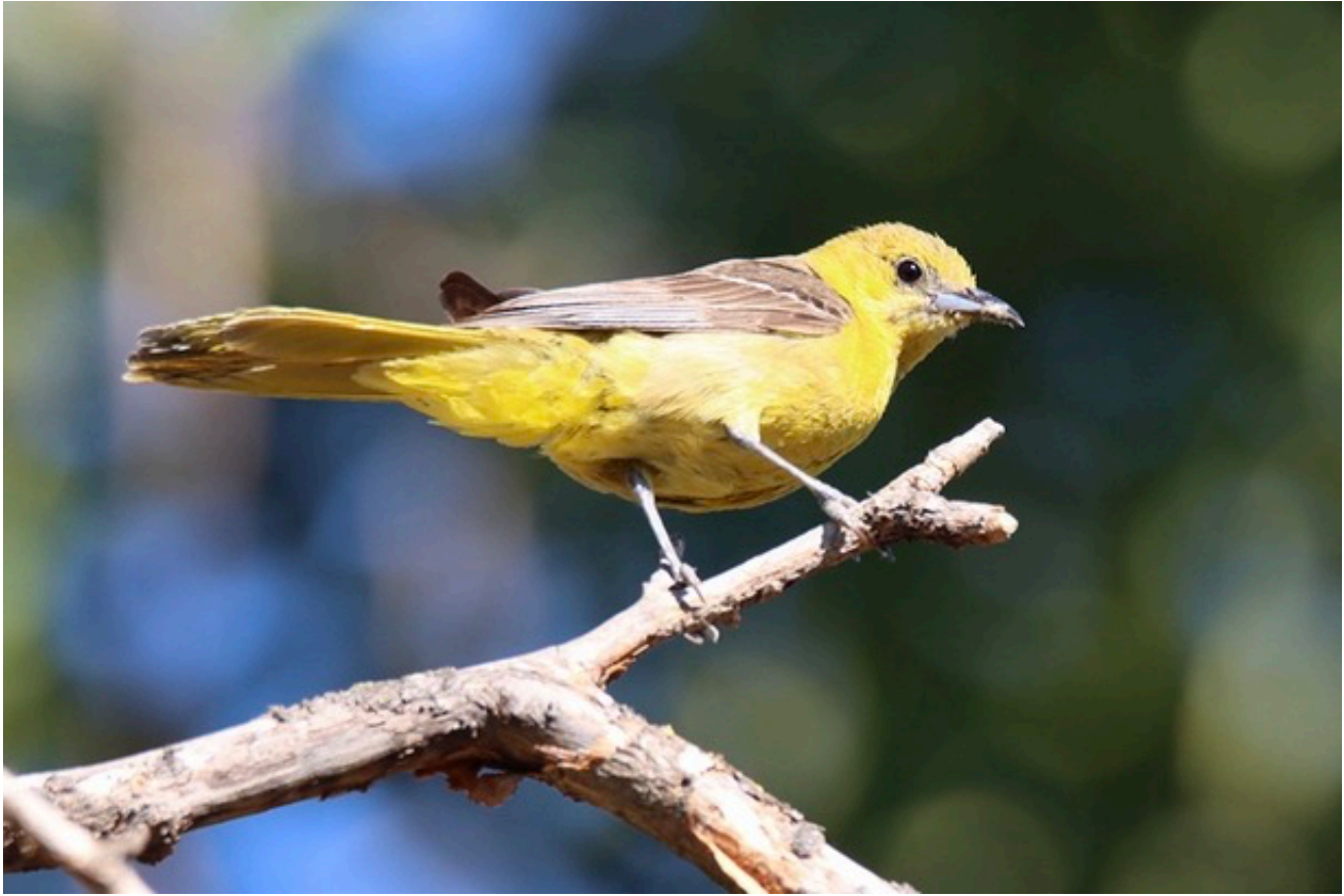
Hooded Oriole (female): Becky Ewens

Males are a bright orange color that immediately draws the eye, an anomaly against the foliage. They have a black throat swatch and black wings with white stripes. Females are a sunny yellow color. They also have dark wings with stripes but lack the black throat of the males.