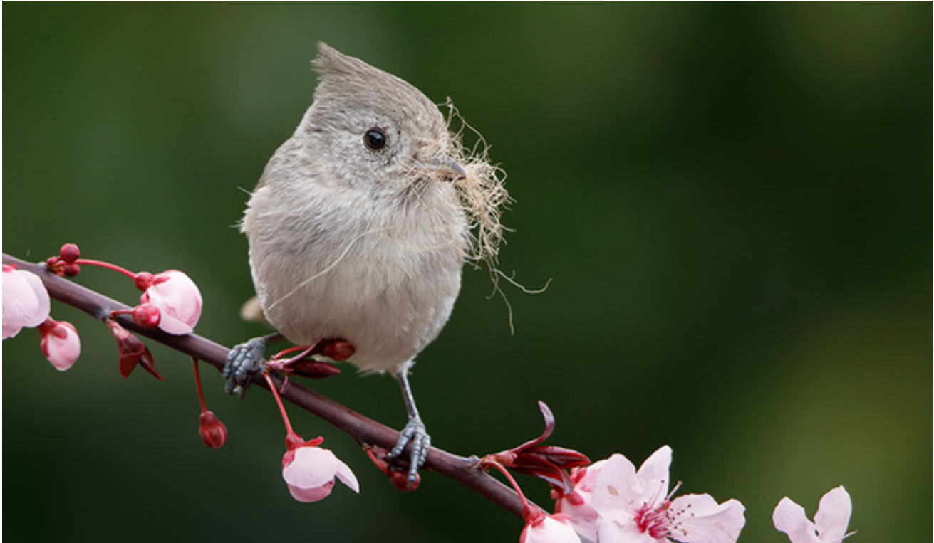
Oak Titmouse with nesting material