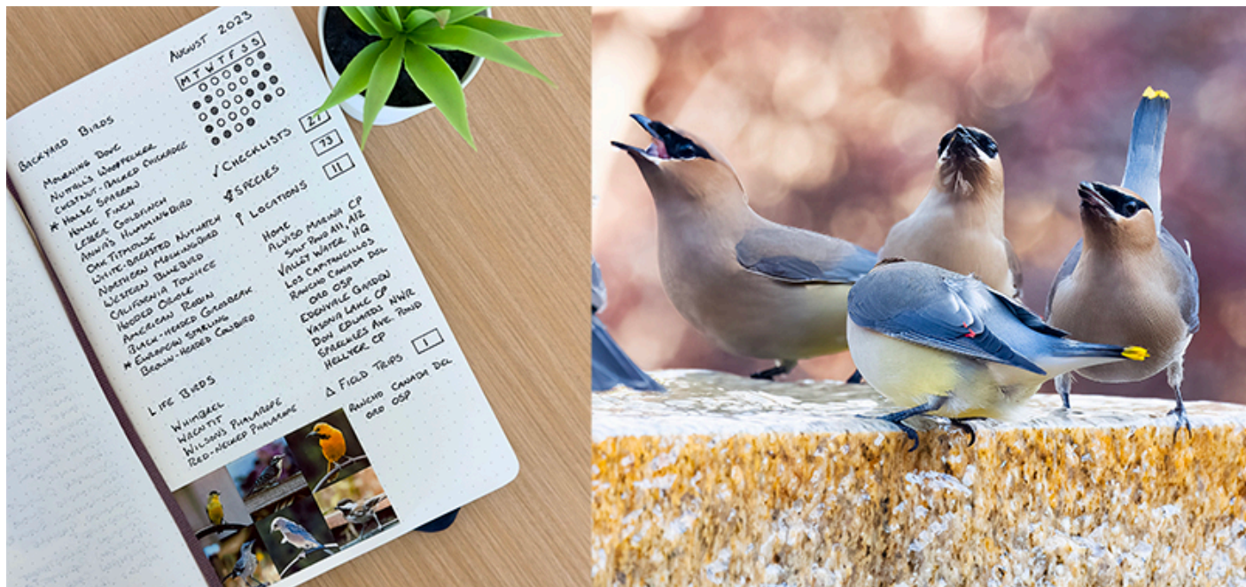
Birding journal by Ryan Ludman. Cedar Waxwings by Deanne Tucker

on which birds to look for in which habitats. Browse our complete collection of guides by location, park name, or season.