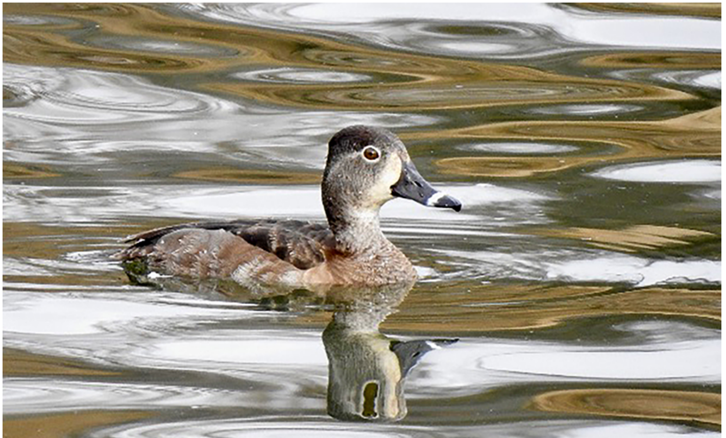
Do you know this duck? if not, try our Waterfowl class this January