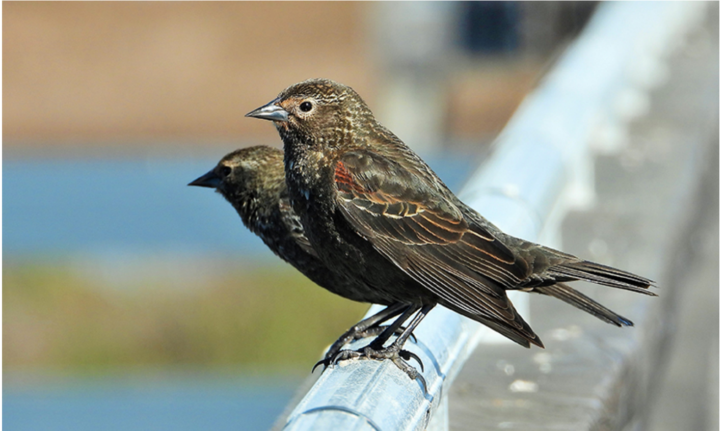
Red-winged Blackbirds, photographed during the 2023 GBBC by Carol Ann Krug Graves