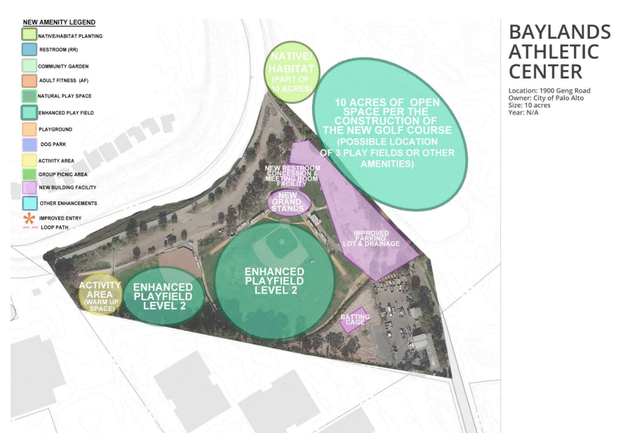
(http://www.migcom.com/files/managed/Document/760/Parks Master Plan - Site Concept Plan Document_052316_Full.pdf )

The Parks and Recreation Master Plan present a unique opportunity to add a unique experience for Palo Alto residents. We appreciate the allocation of an area near the creek to "Native Habitat" and suggest that 1) trees should not be removed from the area ; and 2) the native habitat area be expanded to create a "migratory bird grove" on at least 6 of the 10.5 acres. If any space remains between the San Francisquito Creek Flood Wall and the existing playing fields, we hope that riparian trees can be planted there as well.